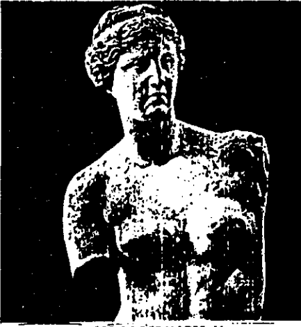
DMC 016 CORPSES AS BEDMATES: Venus Handcuffs Salt Lake City's finest demented blues outfit with on evil streak and some haunting vocals. Debut

DMC 015 THE HOLLOW MEN: Tales Of The Riverbank Leeds duo develop their sound on a fine debut abum binnning with strings and powerchards