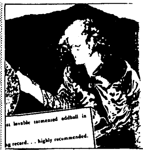
DAC 017 COPERNICUS: From Bacteria Grazy Brooklyn poet with Def arrangements and tongue in check verbal assoults. First UK release