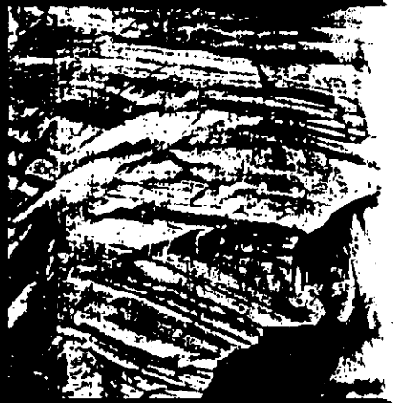
DMC 018 POPPI UK: Poppi Uk Compilation of Poppi Uk's greatest tracks from their previous Dutch releases. Mad guitar pop with powerful arrangements